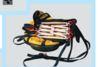
Collapsible Arm Assembly