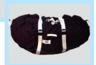
Compact Storage Bag

With the revolutionary cockpit control provided with the FAST Bucket, you can electronically adjust the volume of water per fill as conditions change or as fuel is consumed. The FAST Bucket puts more water on the fire per hour and gives a BETTER VALUE to your customer!