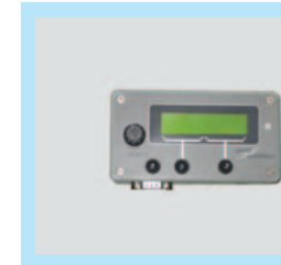
Cockpit Control Box