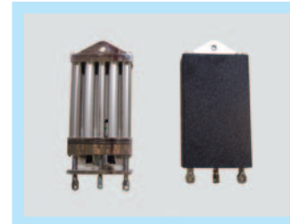
Low Power Acuator